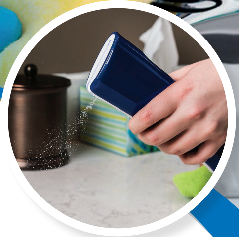
The SAO Dispenser